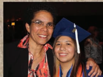
Graduated May 2009 unless marked with symbols below: